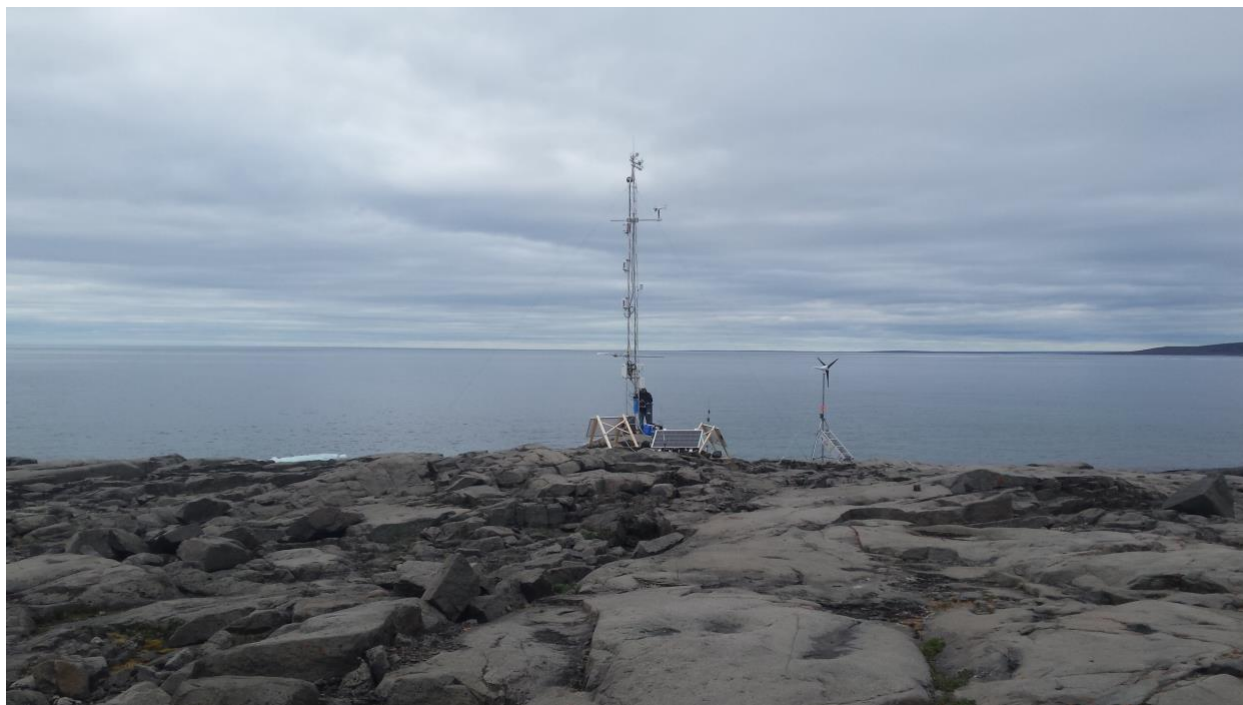
Figure S5. Flux tower just after melt pond season (July 7, 2017).