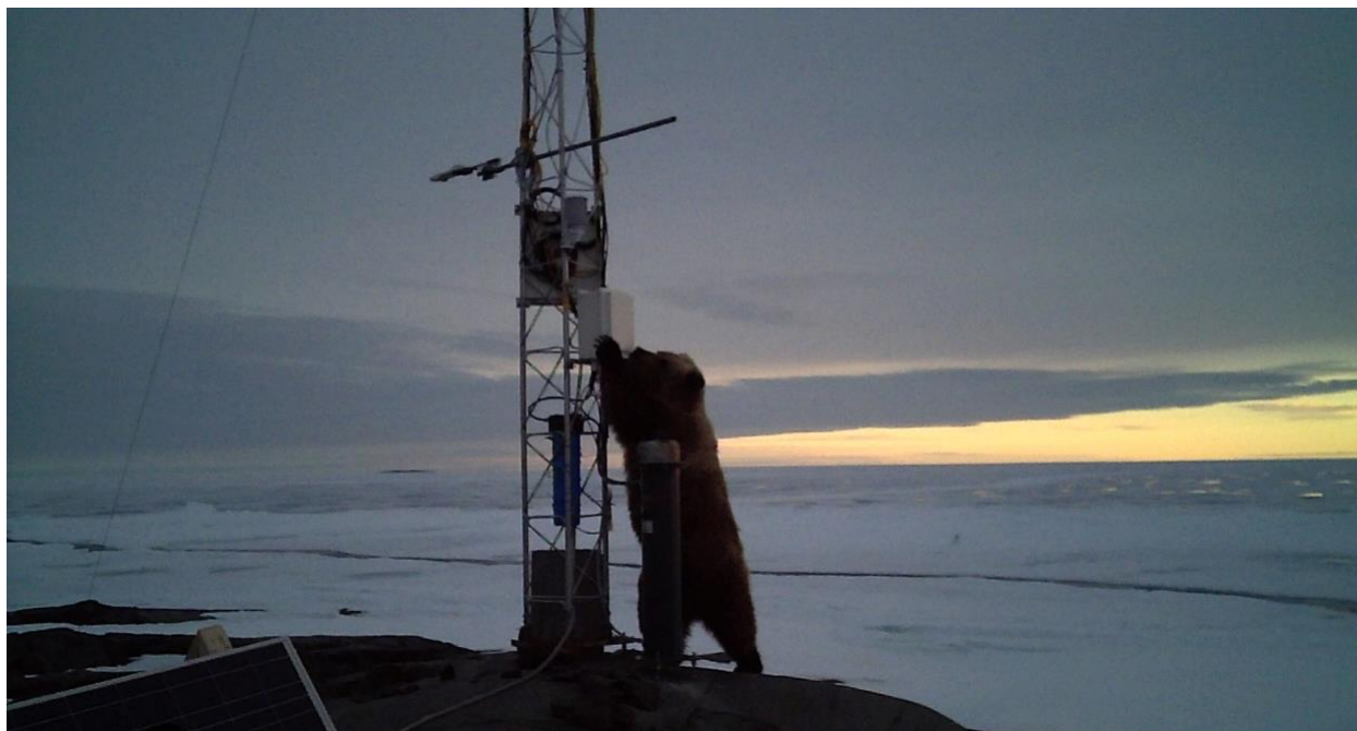
Figure S1. Picture of grizzly bear inspecting flux system. Image captured by motion sensor-activated trail camera.