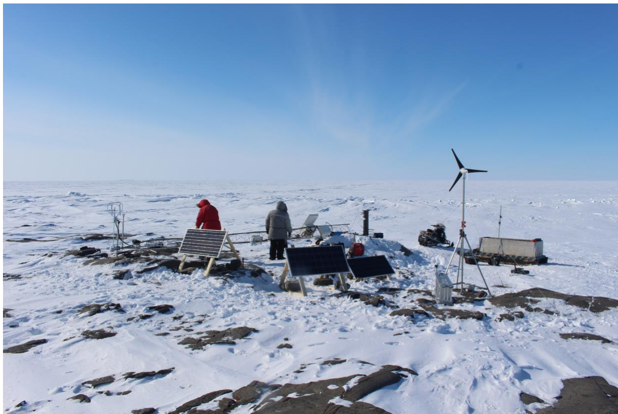
Figure S3. Working on flux tower on April 26, 2017.