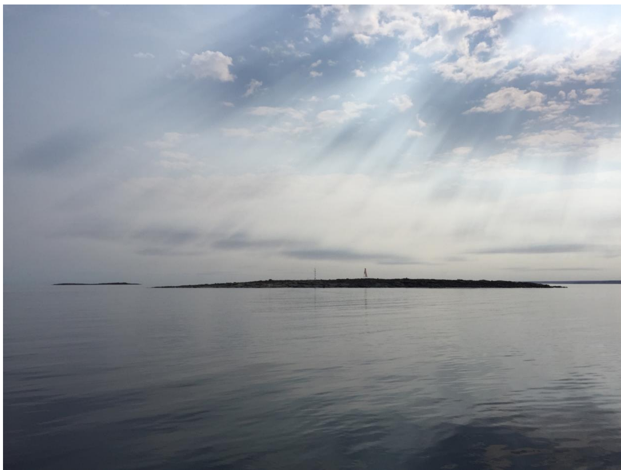
Figure S5. Photograph of Qikirtaarjuk Island taken from the RV Bergmann on August 3, 2017.