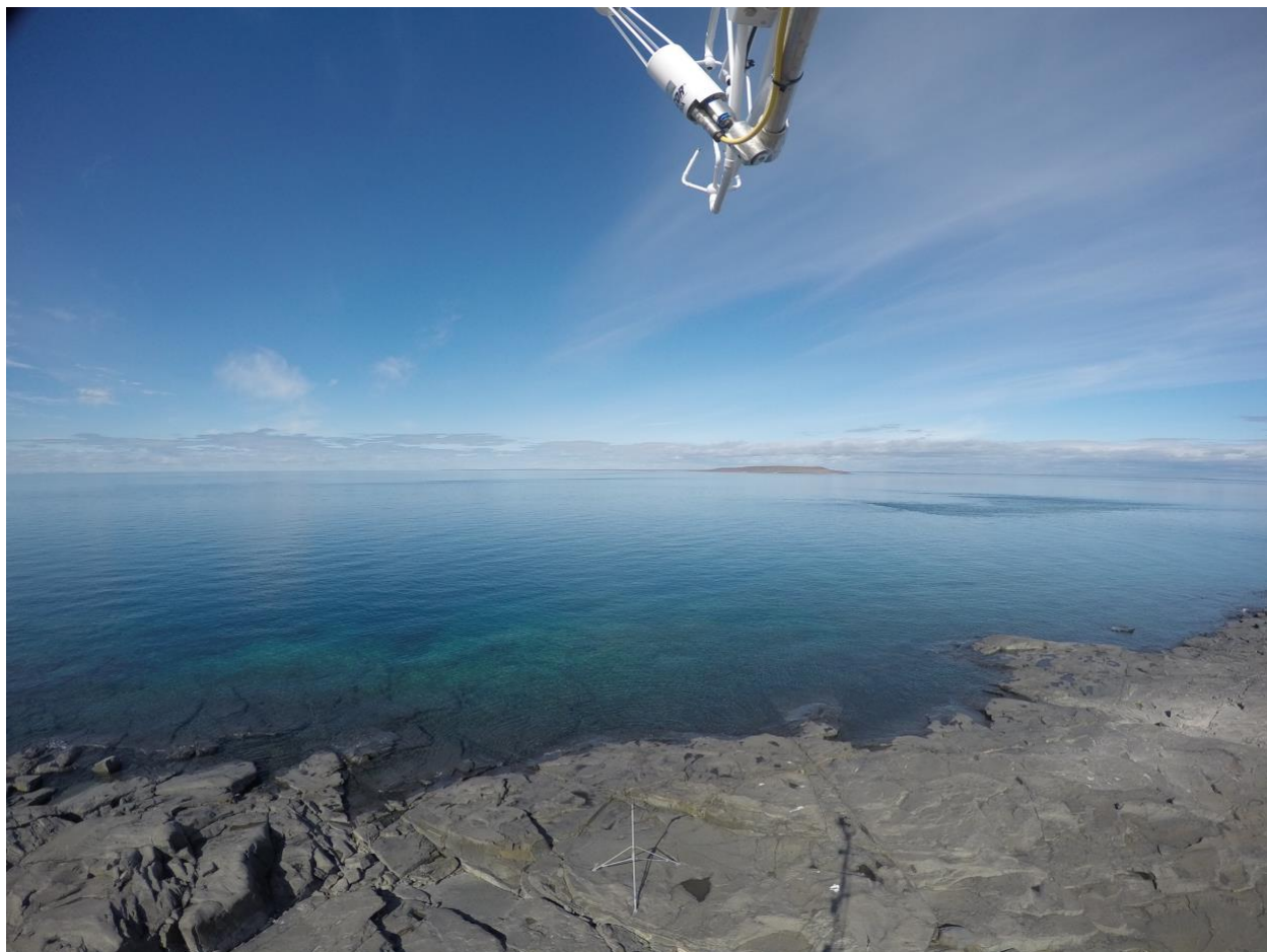
Figure S6. GoPro image from the top of the flux tower.