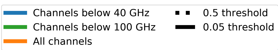
(a) Clear observations