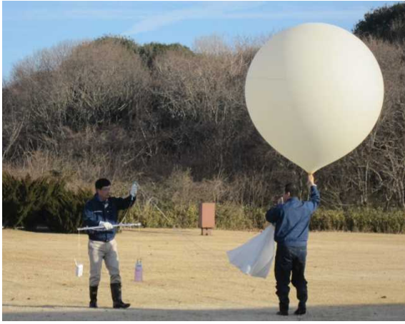
Figure S1: Preparations for a flight launch at 8:30 local time on January 6, 2017. RS-11G and RS92 radiosondes were hung at the two ends of a plastic cardboard rod.