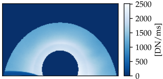
(a) HaloCam RAW , s_n