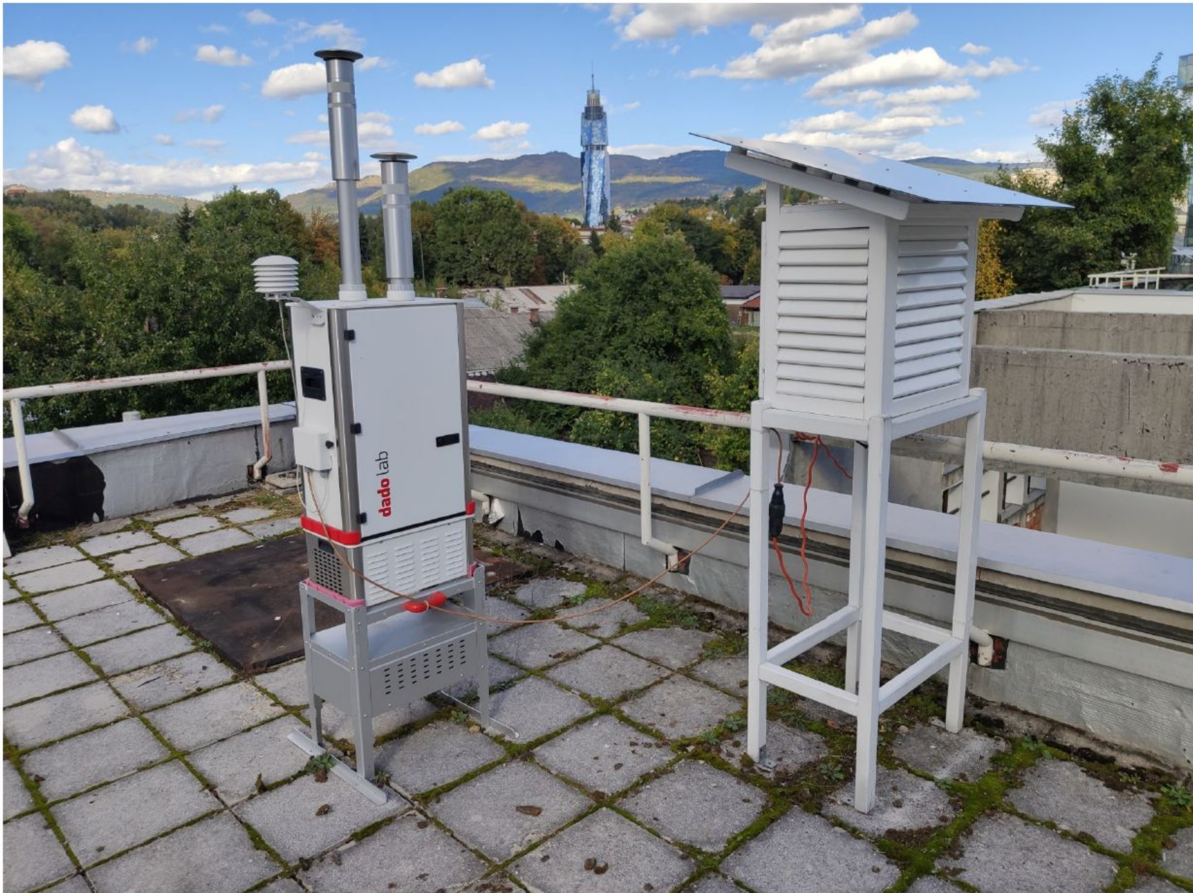
(a) Air sampler and Stevenson screen.