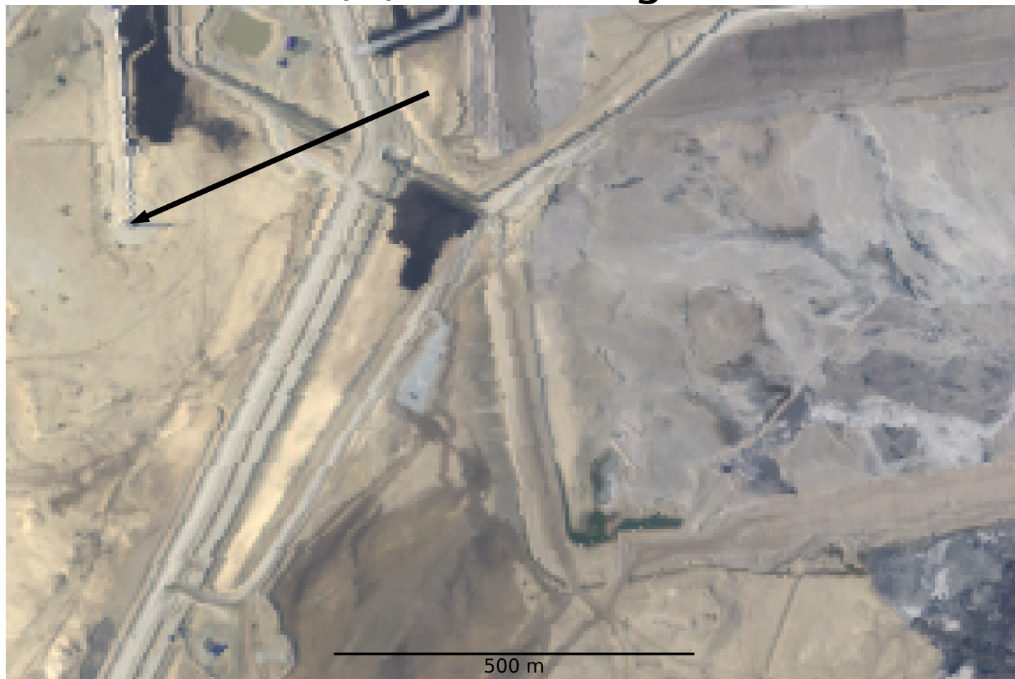
(a) RGB Image

Flight line ang20170812t184250 Source P2