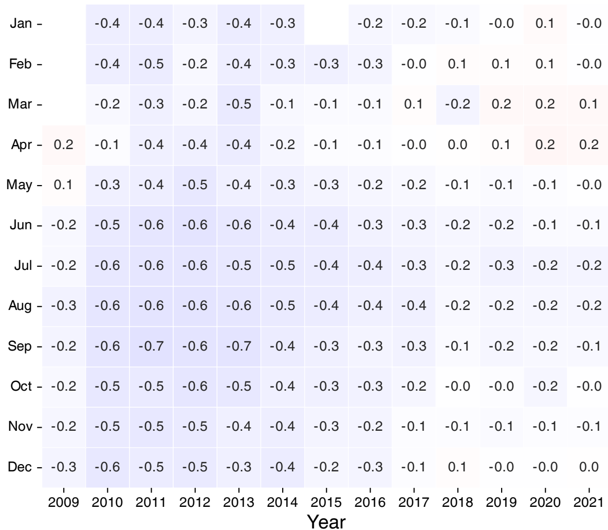
\Delta XCO_2 (Land)