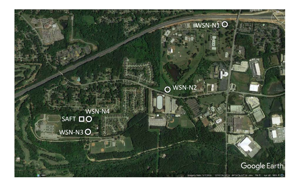
Figure 2. CAIRSENSE project wireless sensor network (WSN) and sensor ad hoc field testing (SAFT) locations. WSN-N4, SAFT, and the WSN communication base station are collocated with the NCore site.

sports fields, and schools (Fig. 2). No known major point source emissions were located nearby. A nearby highway (I-285; 145 000 annual average daily traffic) is located approximately 400 m to the north of the site.