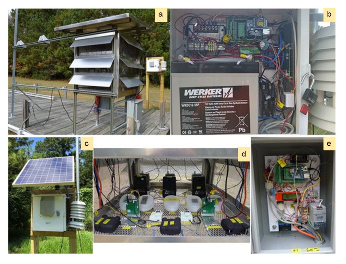
Figure 1. CAIRSENSE field equipment, including (a) SAFT instrument enclosure, (b and c) solar-powered WSN node, (d) interior of SAFT instrument shelter, and (e) WSN node utilizing 120 V (nominal) AC electricity.

the United States, including Decatur, Georgia; Denver, Colorado; and Research Triangle Park, North Carolina. This paper presents the CAIRSENSE testing results of a variety of particulate and gas sensors in a suburban environment of Decatur, Georgia, which is located in the southeastern United States, from August 2014 to May 2015.