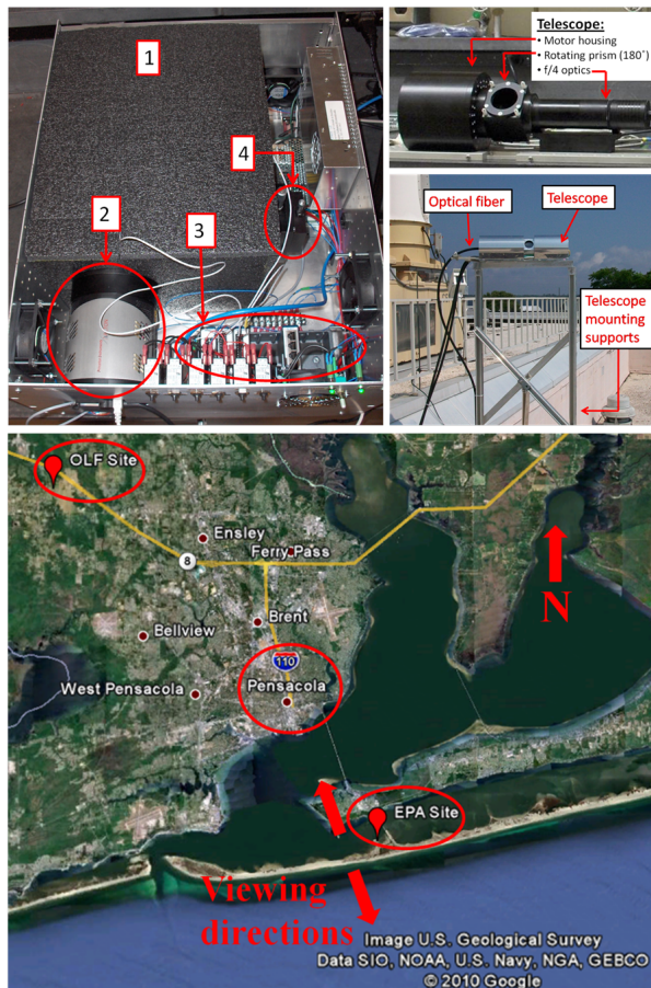
Fig. 1. Figure 1: updated so the inside of the rack can more easily be seen - additionally the caption has been appropriately modified