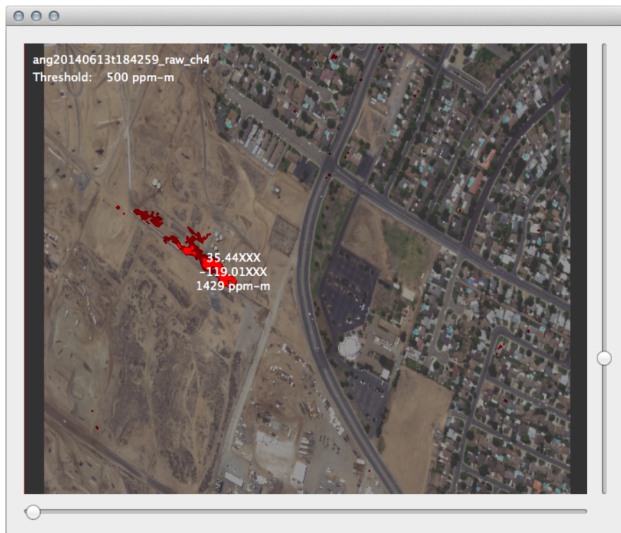
Fig. 2. Upgraded display showing lat/lon coordinates (precise location has been redacted).