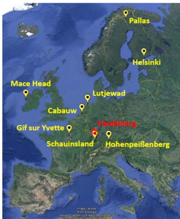
Figure 2: Map of European stations where ^{222}\text{Rn} comparison campaigns were conducted. This map was created with Google Earth ( http://earth.google.com )