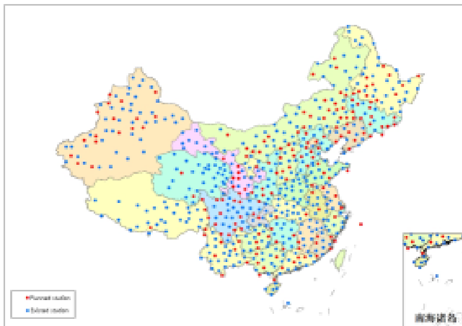
Fig. 2. fig.2 CMA LDN station distribution plan map