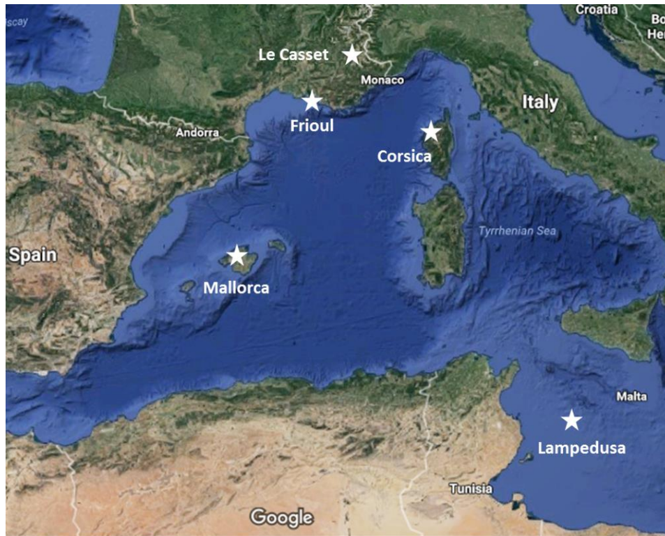
Figure 1: Location of the CARAGA sampling sites in the western Mediterranean basin: Le Casset, Corsica, Frioul, Mallorca and Lampedusa