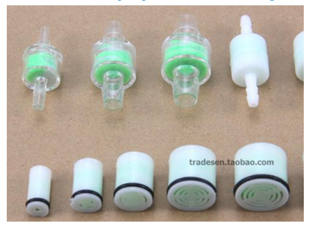
Figure Different type of the hose filter valve, the length is about 4-20mm

The pod is a convenient, lightweight device. It does not have the same complex gas filtration as shore-based equipment. A hose filter valve was used to filter out the water vapor, particles and soot. Its figure is as follow.