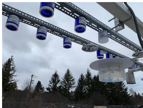
Figure S2 Photographs of the deployment set up in Toronto (left) and Rende (right).