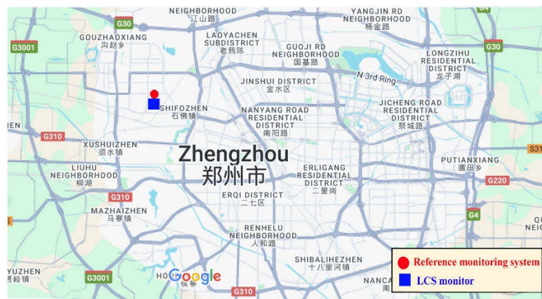
Figure 1 Location of the air quality monitoring station during the measurement period

(3) Additionally, in Section 2.1, the inclusion of a map illustrating the data collection site would provide crucial contextual information.